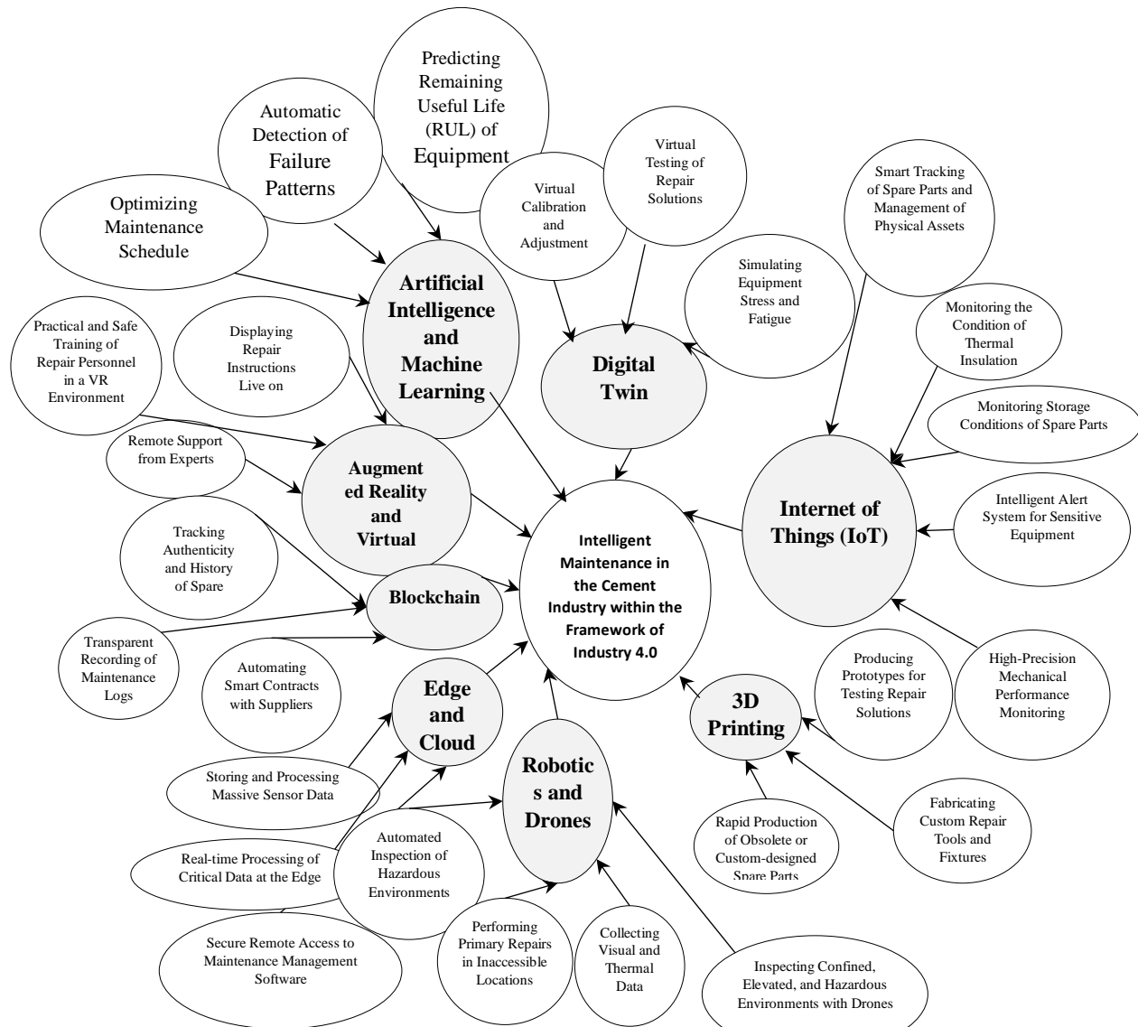
Figure 3. Components and Categories of Intelligentization of Maintenance in the Cement Industry